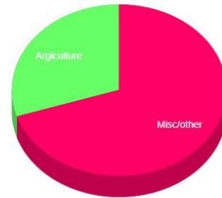
Nitrogen contribution by percentage